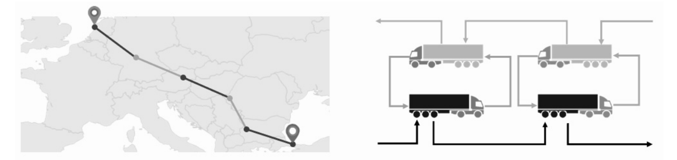
Figure 1: relay traffic transport system

help the parking problem because only the truck without the trailer needs to be parked. Nevertheless, this type of transport requires a certain company size since a network of drivers in different regions is needed. In Germany, however, 73% of the forwarding companies have less than 100 employees. On average, a transport company has 11 employees [6]. Intra-company relay traffic is therefore not economically viable for most transport companies. There is a need for an intelligent algorithm which is capable of planning this more complex method of transportation. So far, there is no solution for the organization of relay transport across forwarding companies. An explanation of this relay traffic transport system can be seen in Figure 1. For example, one delivery goes from Antwerp to Istanbul and the other way around. Instead of one driver driving all the way, the route is split into five sections. In this case the driver who starts in Antwerp only drives to a switching point near Frankfurt and drives back home with the trailer destinated for Antwerp. This principle repeats itself in the other five sections for the other drivers.